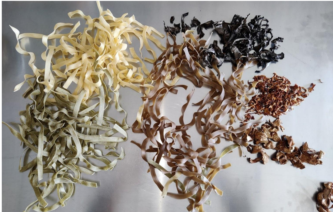
Naturegeist nettle egg and walnut pasta with wild mushrooms from the wider Jajce region. (Owner: Esma Zjajo; Photo by Maja Barisic)

their reference groups, as well as internalized aversion to risks that outdoor and adventure activities entail. Women are a third of self-employed persons in BiH, partially because of socially instructed aversion to risk, discouragement, time poverty, and lower access to resources, while women-owned businesses are mostly micro-enterprises, and tourism-related activities are a small share of those businesses (Finding 20). Although BiH does not collect and use data on gender differences in tourists' expectations and experiences about BiH as a tourist destination, general observations from interviews are that women solo travelers still need safety provisions in the region of Western Balkans, especially in outdoor activities, even though actual incidents are rare. LGBTIQ persons are not safe in all parts of BiH, while some women may also experience verbal abuse based on cultural background (Finding 21).