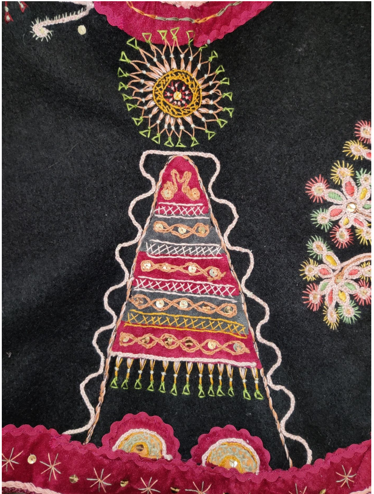
Interpretation of traditional embroidery on an Orthodox folk costume from Sarajevo region called "ćurdija". Work of women from the Jajce Culture and Arts Association (Owner: KUD Jajce;)